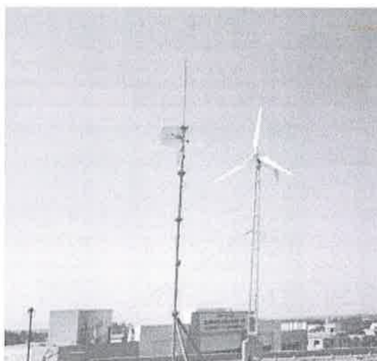
Scanned by CamScanner