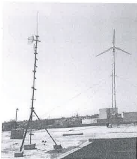
Scanned by CamScanner